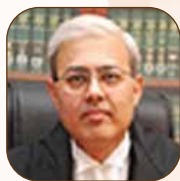
Hon'ble Justice Manmohan Judge, Delhi High Court