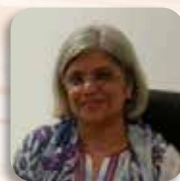
Meenakshi Arora Senior Advocate Supreme Court of India